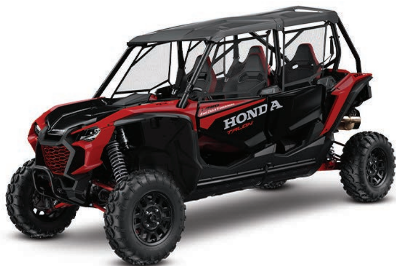
2022 Talon 1000X-4 FOX Live Valve